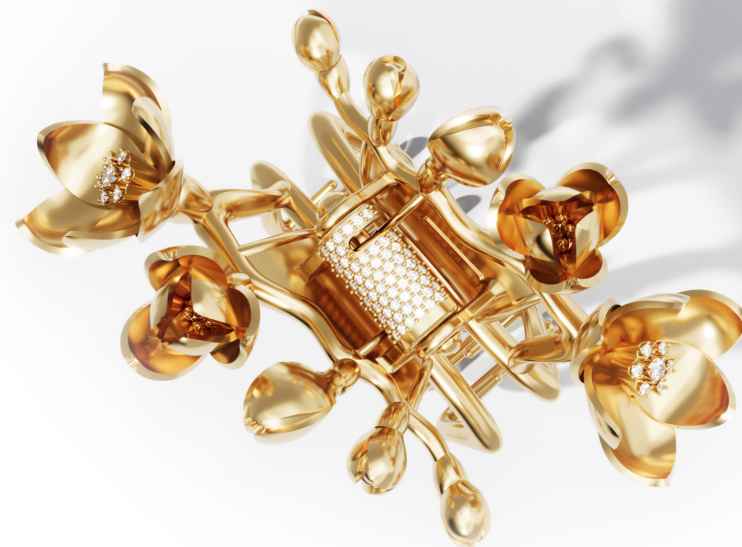
Jewellery dipped in an 18k gold bath (electroplated 0,3 \mu m), hand polished, top quality brass, prong set white zirconia