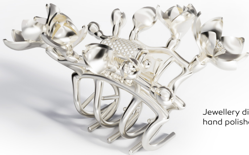
Jewellery dipped in rhodium bath (electroplated 0,1 \mu m), hand polished, top quality brass, prong set white zirconia