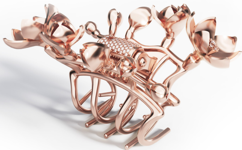
Jewellery dipped in an 18k rose gold bath (electroplated 0,3 \mu m), hand polished, top quality brass, prong set white zirconia